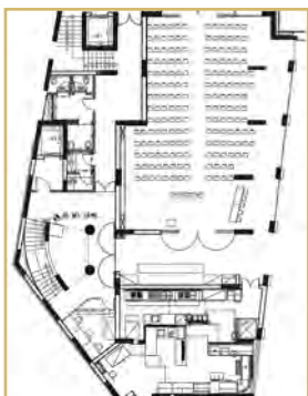
CONFERENCE HALL DAPHNE I THEATRE SHAPE 170 PERS.