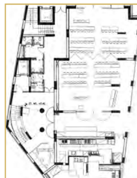
CONFERENCE HALLS DAPHNE II DAPHNE III SCHOOL SHAPE 40 or 50 PERS.