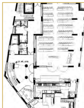
CONFERENCE HALL DAPHNE I SCHOOL SHAPE up to 100 PERS.