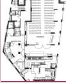
CONFERENCE HALL DAPHNE I THEATRE SHAPE 170 PERS.