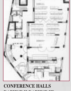
DAPHNE II DAPHNE III SCHOOL SHAPE 40 or 50 PERS.