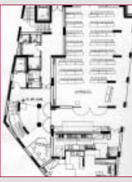
CONFERENCE DAPHNE ICONFERESCHOOL SHAPE up to 100 PERS.DAPHNE I