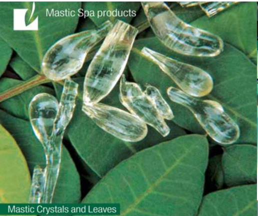
Mastic Crystals and Leaves